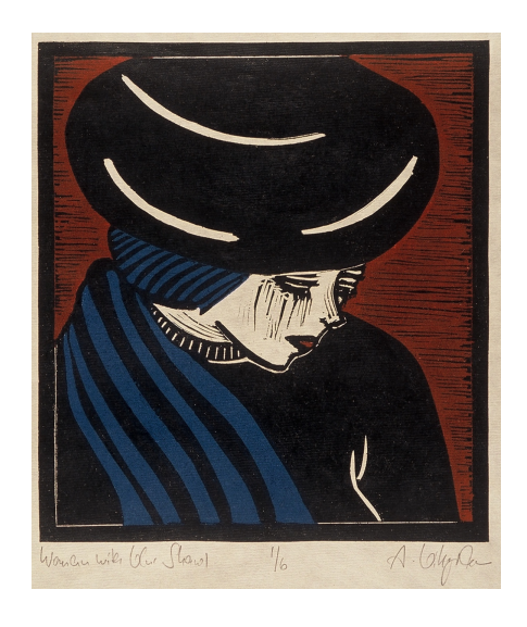
Angelika Villagrana Woman with blue Shawl 9" x 8"- Woodcut SOLD