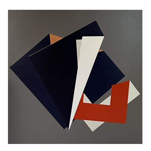
SECOND PLACE AWARD True Ryndes ORIGIN 40" x 40" x 2" – Standard & Interference Acrylics on Gallery-wrapped Canvas