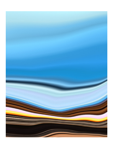
Garrett Demarest The Music 24" x 30 x 1.5" Photo printed on Metal