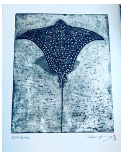
Bonnie Maxey Cruising 13" x 10" – Intaglio/Aquatint on Copper - SOLD