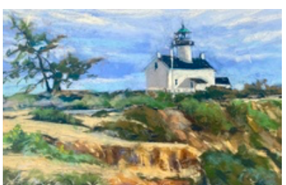
Anne Kullaf Cabrillo Light 10" x 15" – Pastel on sanded Paper -