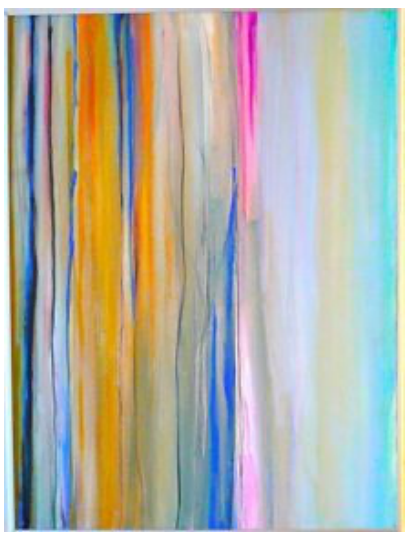
Laura Laslo Parallel Chromatic 24" x 18" – Acrylic