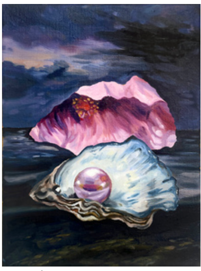
Jackie Farkas A world in a world 9" x 12" - Oil on Linen