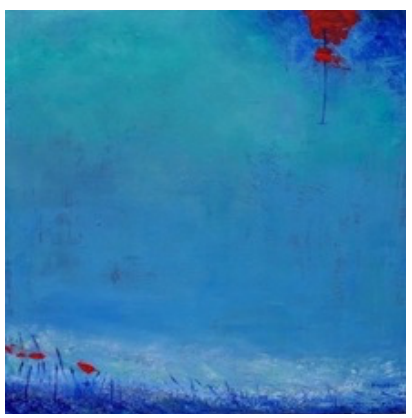
Peggy Hinaekian Red Cloud in Blue Sky 36" x 36" – Mixed Media on Canvas