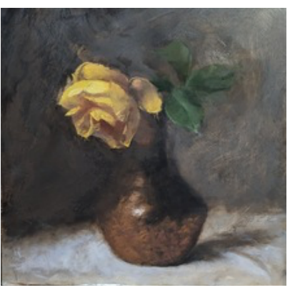
Jeff Crusberg Yellow & Copper 12" x 12" Oil on Panel - SOLD