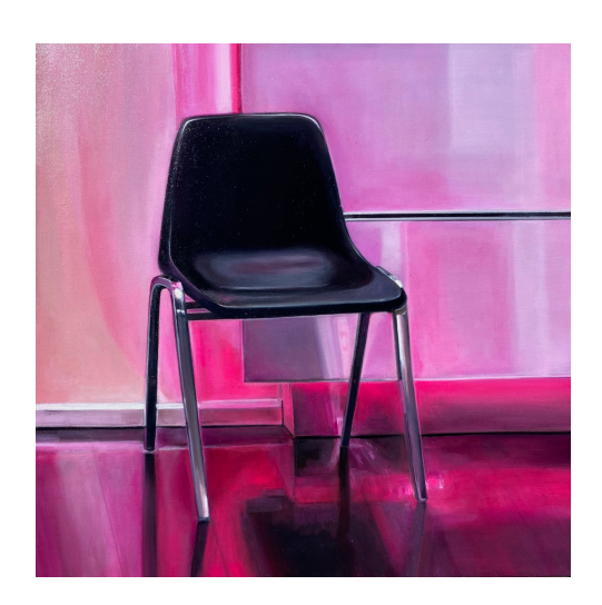
Yahel Yan Studio 54 24" x 24" – Oil on Canvas