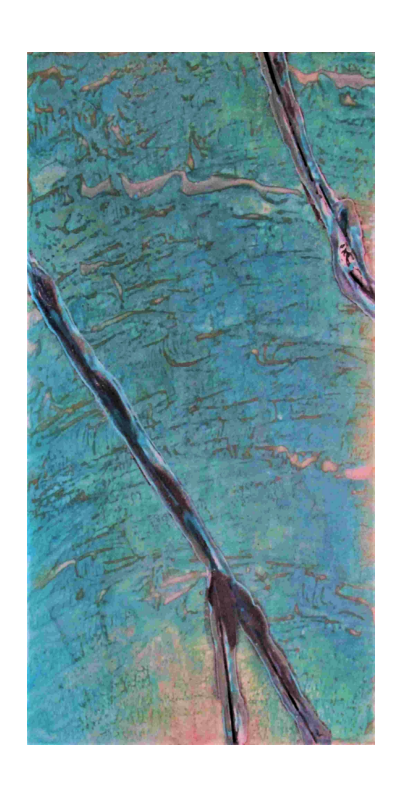
Ed Whitmore Eerie Calm 24" x 12" – Oxidized Bronze on Wood Planks