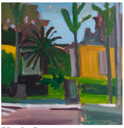
Kevin Inman Point Loma Blvd 16" x 16" – Oil on Panel