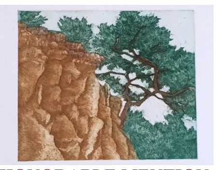
HONORABLE MENTION Julianne Ricksecker Torrey Pines, Reaching 10" x 12" - Etching & Aquatint