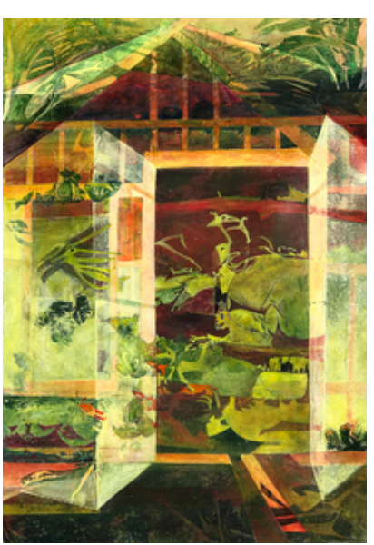
Carol Mansfield Portal 22" x 15" – Acrylic on Watercolor Paper