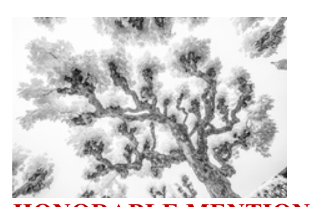
HONORABLE MENTION Will Gibson Pollarded Sycamore #9882 26" x 22" - Pigment Print Photo