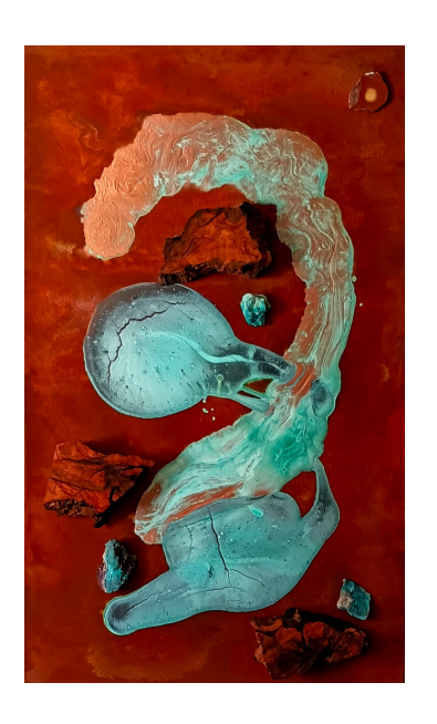
THIRD PLACE AWARD

Ed Whitmore Primordial Soup 40" x 24" - Oxidized Iron Copper Bronze on Wood, augmented with Chunks of polished Olive Wood & Agates