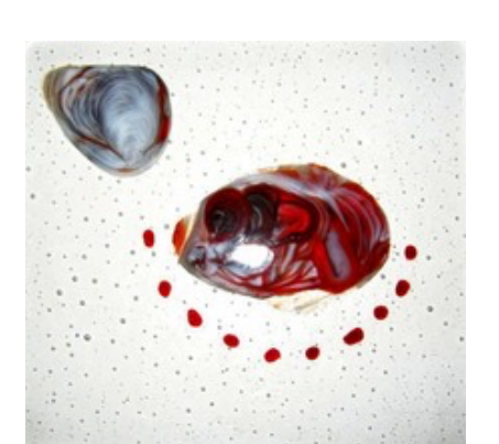
Beryl Brenner Sophisticated Piece 10" h x 10" w Fused Glass