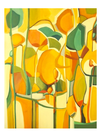
Anahid Minatsaghanian Color of Season 48" x 36" – Acrylic on Canvas