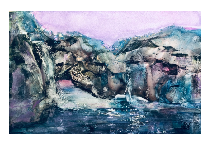
Vita Sorrentino Symphony of Waterfalls 20" x 12" – Arches on Watercolor Paper