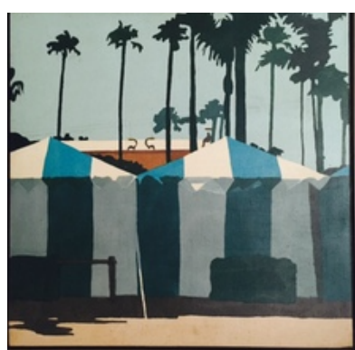
Warren Bakley <u>SKYRIDE</u> (Del Mar Fair Grounds) 24" x 24" – Acrylic on Canvas <u>SOLD</u>