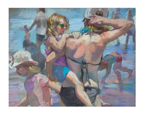
Glen Maxion Little Hipster 19" x 25" – Soft Pastel on Paper