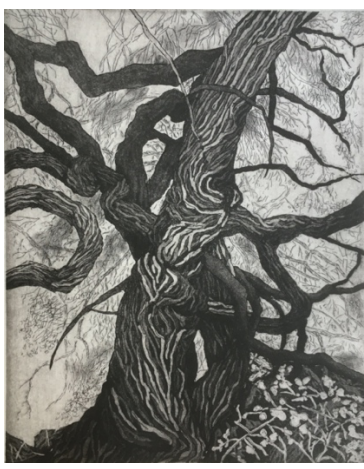
Julianne Ricksecker Mission Trails Oak 10" x 7" – Etching & Aquatint