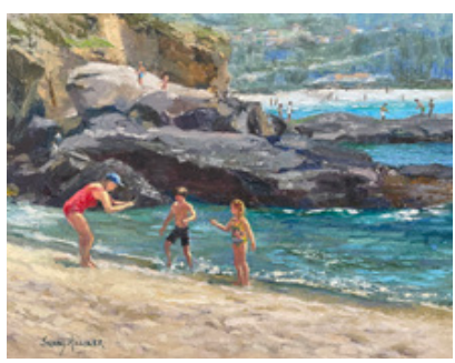
Sunny Hilliker Picture Perfect Day 11" x 14" – Oil on Linen