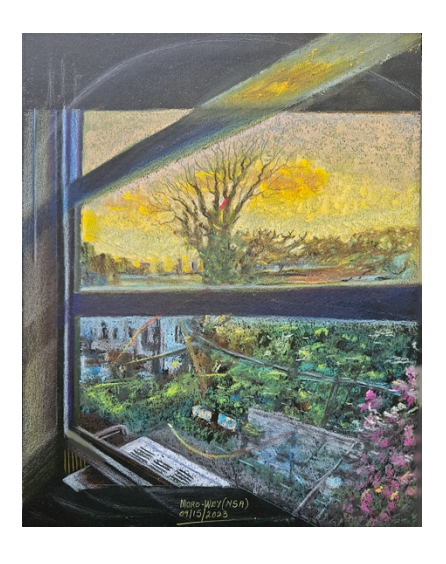
Billy Moro-Wey My studio window 14" x 11" – Soft Pastel on Paper