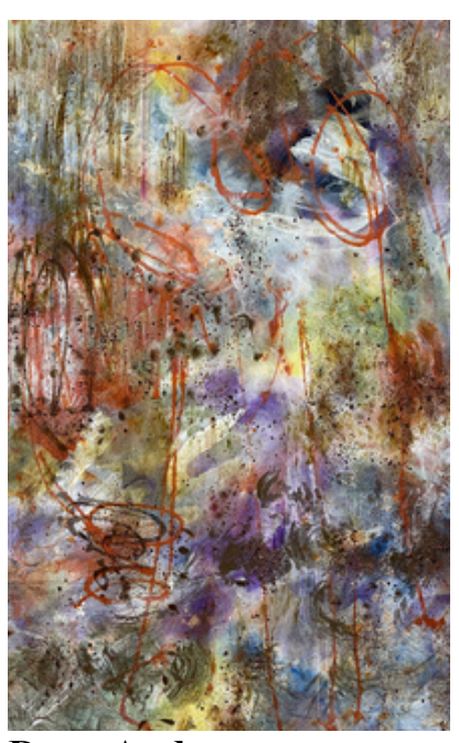
Dean Andrews Enamored 58" x 36" - Acrylic with Cacao on Canvas