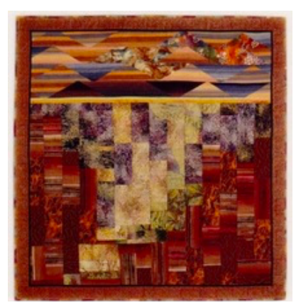
Doria Goocher Red Rock Country 42 "x 36" – Art Quilt: Cotton and Metallic Fabric